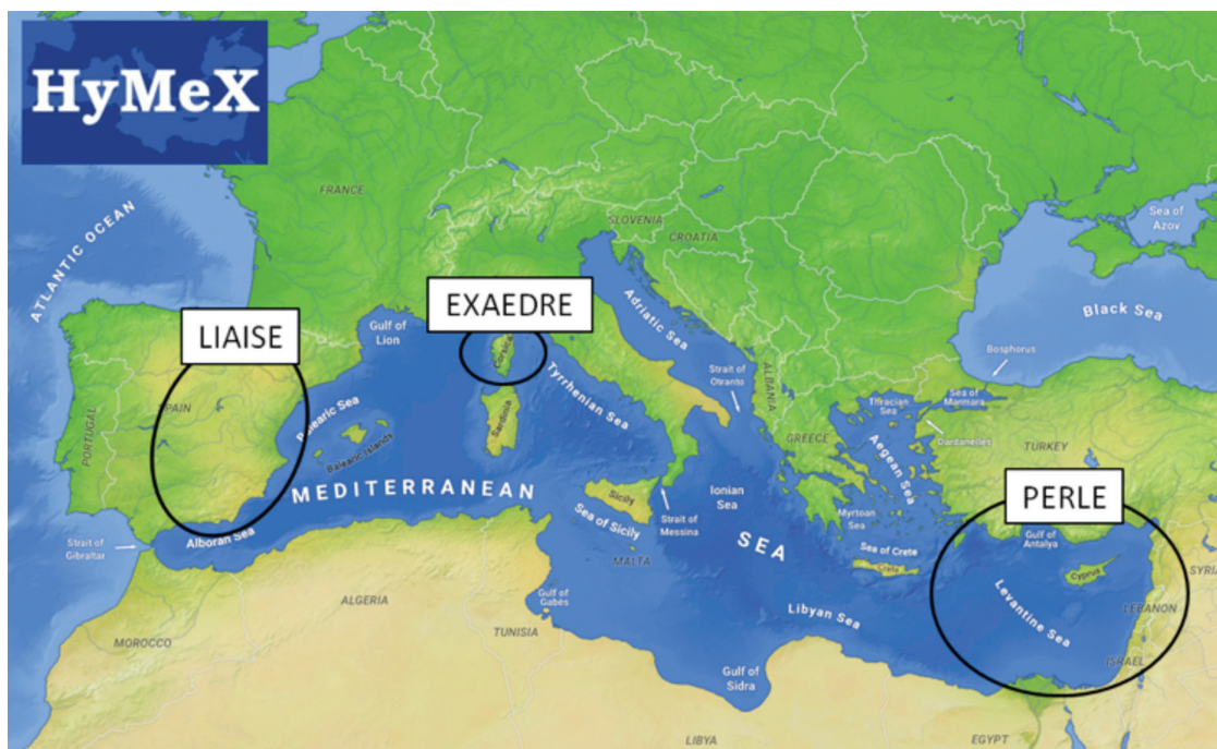
Location of the future field campaigns planned within the frame of HyMeX.