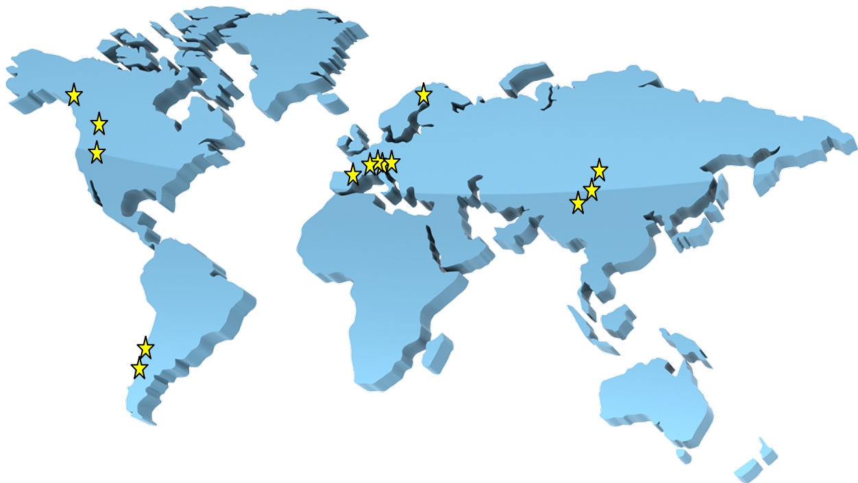
Fig. 2: Location of some initial possible INARCH sites.