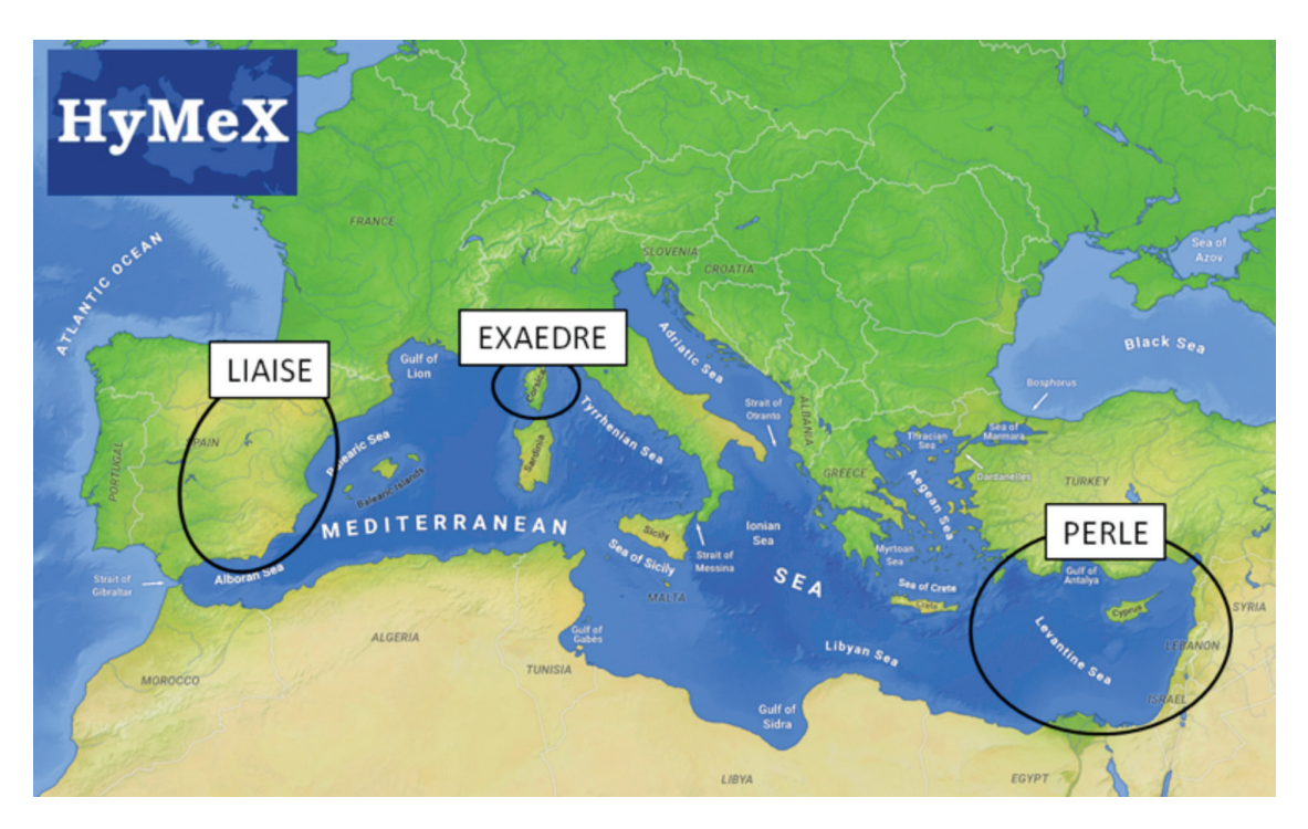
Location of the future field campaigns planned within the frame of HyMeX.