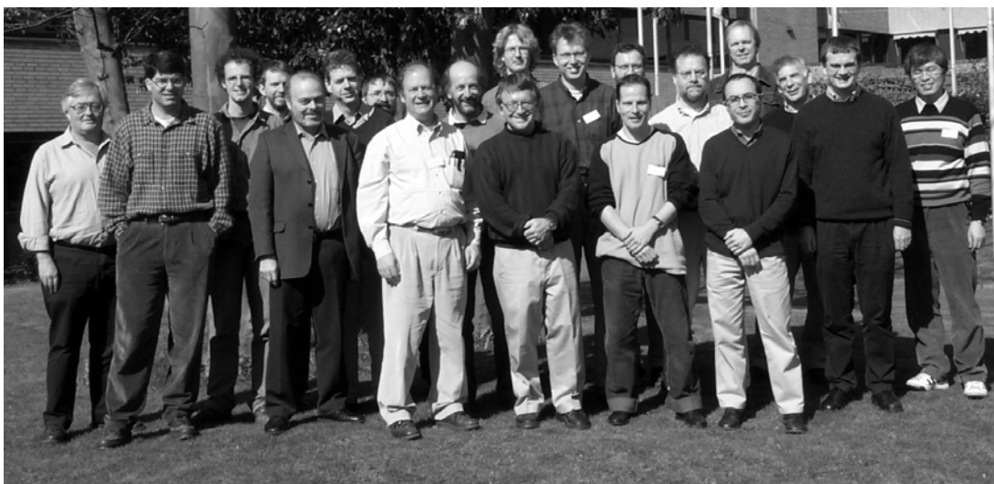
The participants at the first GABLS workshop at ECMWF, March 25-27, 2002.

At the ECMWF-workshop many questions were raised, such as: Why do (most) models like enhanced mixing in stable cases? What is the role of the atmosphere-land surface coupling for SBLs (see also Van de Wiel et al., 2002a, b)? How do models compare with the new data available (such as from CASES-99; see Poulos et al., 2002)? How important is model vertical resolution? Subsequently, the GABLS plans were presented at a meeting during the AMS 15th Symposium on Boundary Layers and Turbulence in Wageningen, the Netherlands. About