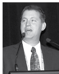
Roger Pielke, Jr.

Five keynote speakers presented their ideas on the state of climate change research. The first keynote speech was delivered