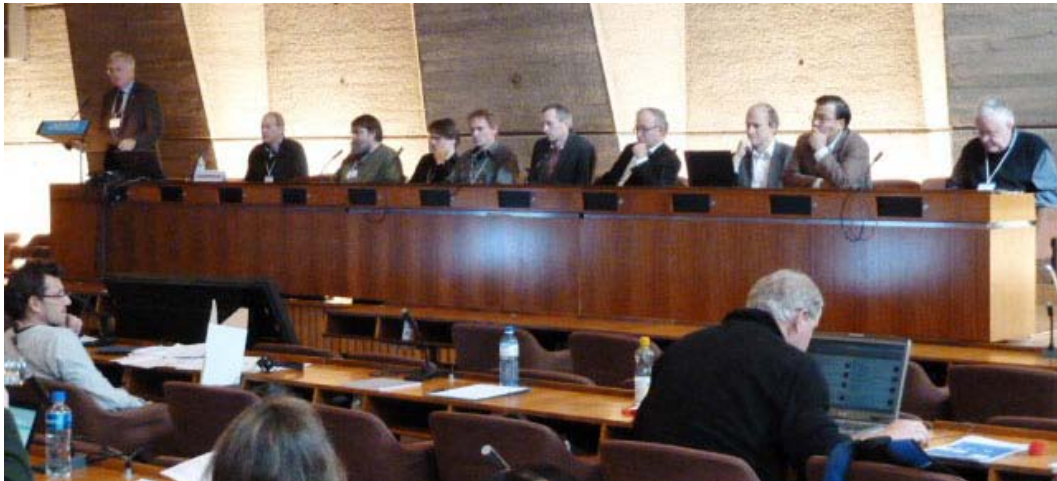
Briefing and discussion session