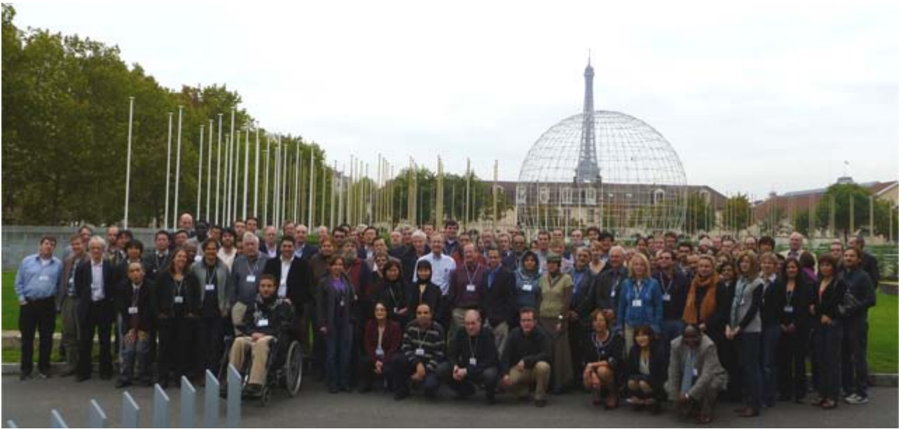
Workshop participants at the UNESCO Headquarters